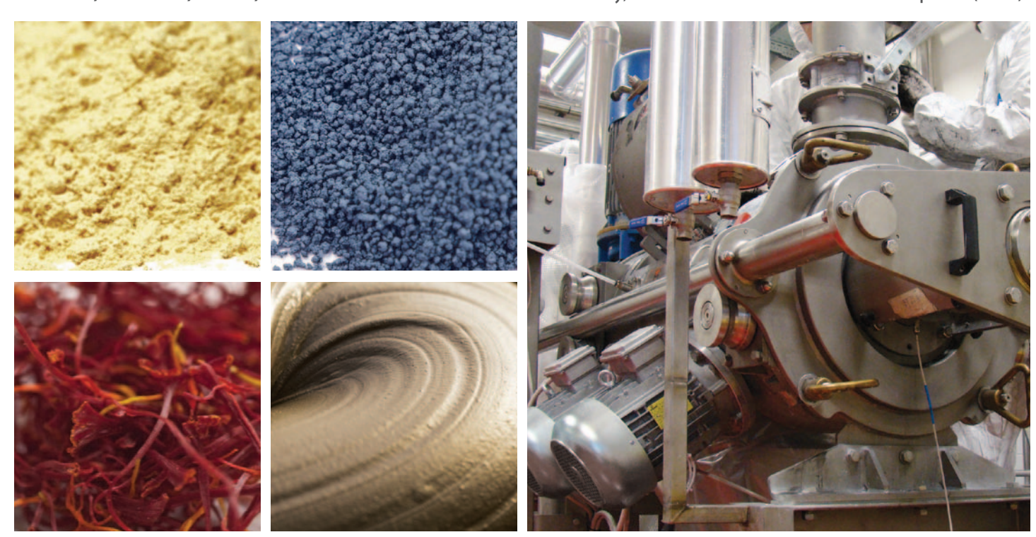
Powders, Granules, Fibers, Pastes can be tested in the new laboratory, even in classified hazardous atmosphere (ATEX).

MIX guarantees the confidentiality of the processed information and that the results obtained during trials in the testing facility are scalable and repeatable with industrial mixers. It is now much easier to determine the characteristics of each raw material and, therefore, identify the most suitable mixing techniques for obtaining the desired final result.